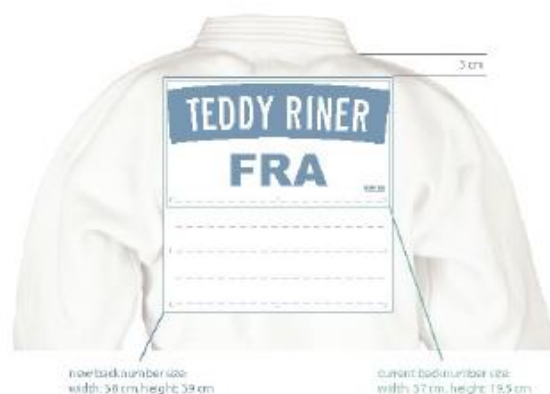
New back identification of athletes 01.01.2011

Each competitor taking part in the AJU events is obliged to have sewn on the back of his judogi the official backnumber bearing his surname and his National Olympic Committee abbreviation. The backnumber can be ordered from www.ijfbacknumber.com or www.mybacknumber.com (Attention: production and delivery takes around 4 weeks).